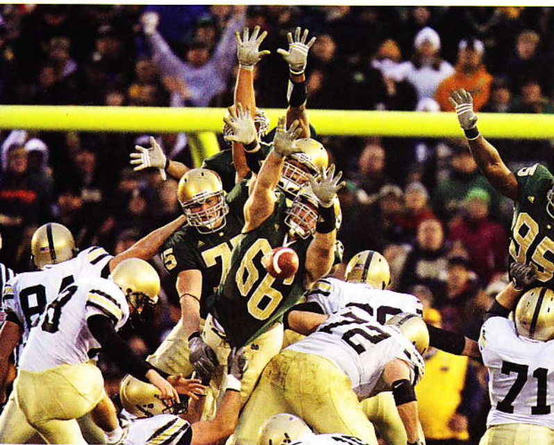
Erin Go Bragh: The Notre Dame Fighting Irish trounced the Army Black Knights the last time they played, in South Bend, Indiana, in 2006.

"November's sky is chill and drear, November's leaf is red and sear." —Sir Walter Scott