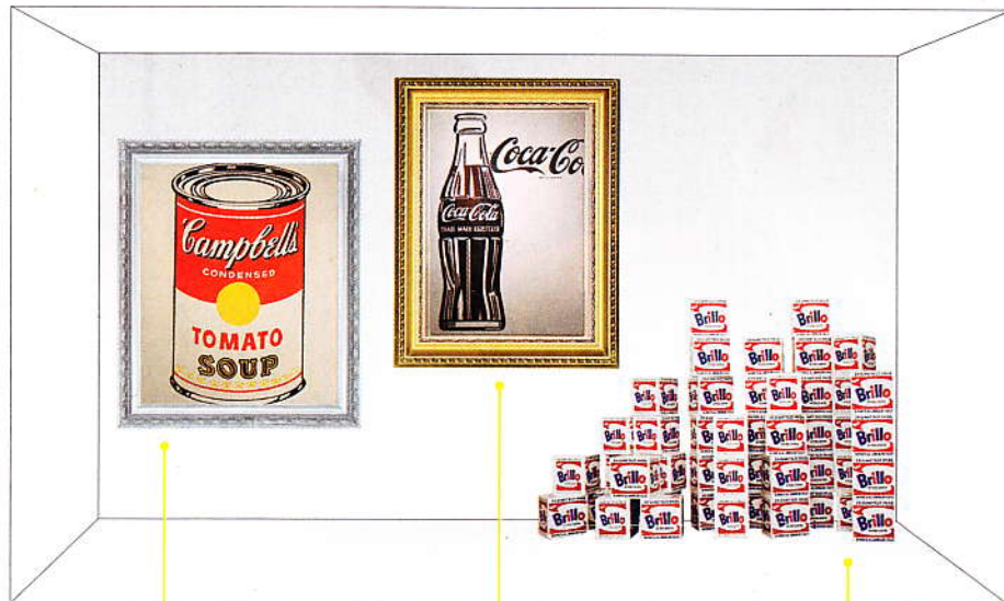
CAMPBELL'S SOUP CAN (TOMATO), 1962

It's been 50 years since Andy Warhol debuted his 32 prints of Campbell's soup cans at a Los Angeles gallery, selling them for what today seems like pennies. As his works have since skyrocketed in value (and likely out of your price range), take comfort in knowing you can still afford the products they feature.